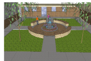
Courtyard view from Ferriday Drive

ory of your family or friend, contact Melissa Loomis at 318-757-7831 or check out our Facebook page.