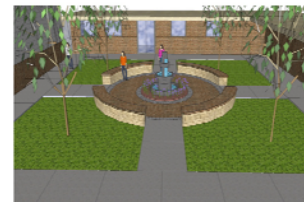
Courtyard view from Ferriday Drive